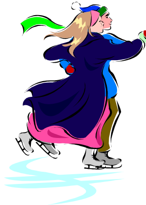
Got an activity to post? Contact Pastor.

we will be celebrating Mardi Gras on Feb. 16 ! This will be another Cajun Cooking themed dinner, complete with costumes and prizes for the best costumes, along with other fun activities. In January we have the following events on the calendar: WELCA will meet on Saturday, January 9 at 9:00 a.m. in